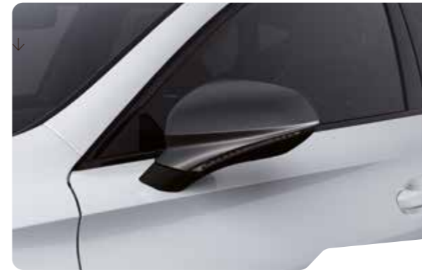
↓ NEVADA WHITE M S