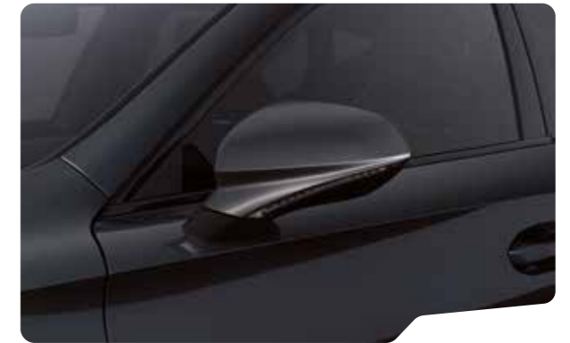
↓ MAGNETIC TECH M S