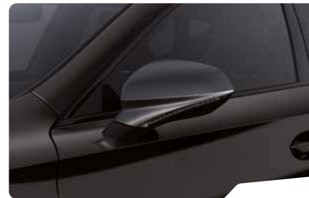
↓ MIDNIGHT BLACK M S