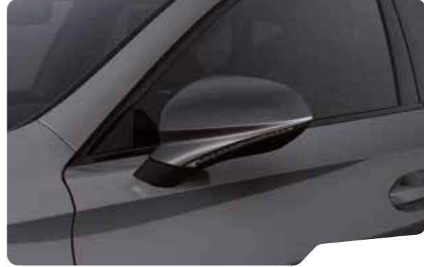
↓ GRAPHENE GREY PM O