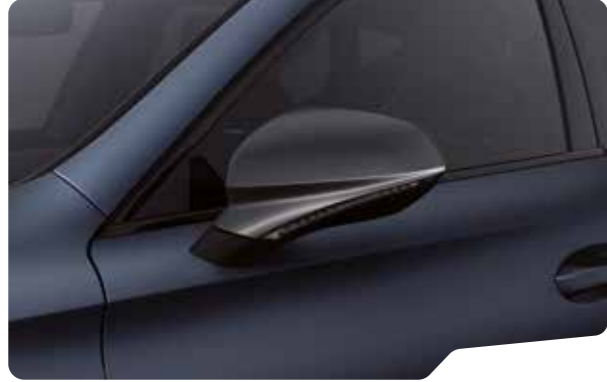
↓ PETROL BLUE MATTE O